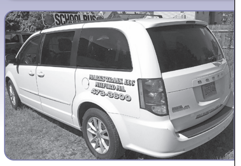
Office is located at 51 East Main St., Milford, MA Office hours are Mon-Fri, 9:00 AM-5 PM