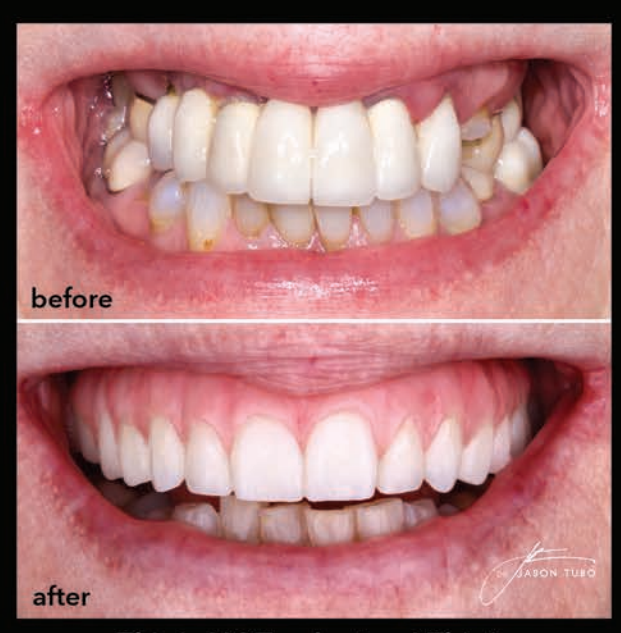
This is NOT a denture! This is permanent teeth on implants

All in one office... The most advanced "teeth in a day" solution in the world is HERE