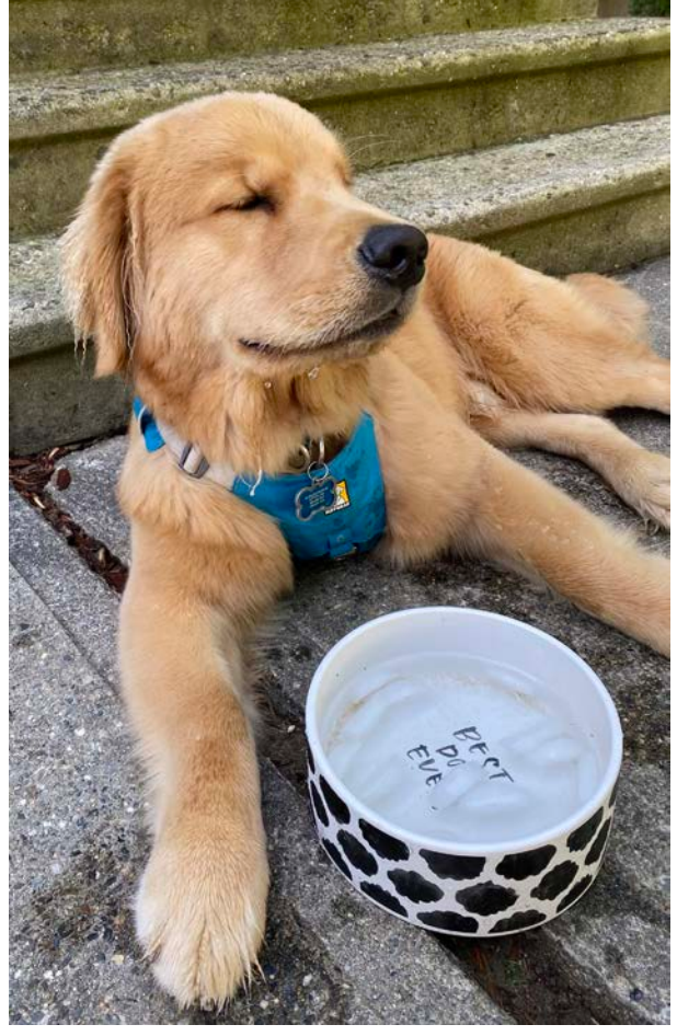
"More ice, please."