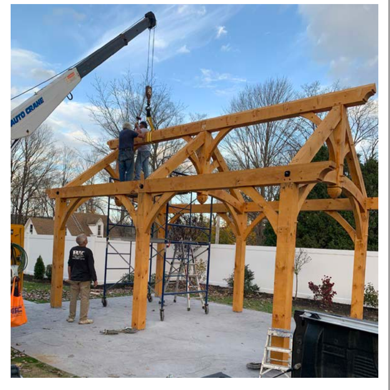
A handsome post-and-beam pavilion will be one of the crowning touches to a gateway park being built in the area of Oxford Center by the Oxford Business Association.

Recently, motorists passing by the park could see all of the labor that has gone into the project already. Hundreds of flower bulbs—daffodil, tulip, crocus and hyacinth—were planted by members of Boy Scout Troop 147 and volunteers with two hundred more to go. Attractive fencing was installed. Landscaping was done. A split-rail fence running parallel to the parking lot is in the offing. The "true post-and-beam pavilion" has been finished with