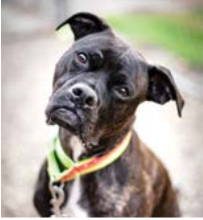
Donate today and help dogs like Gordon.

Donations will help provide the animals in Lake Humane's care with a warm bed, nutritious food, medical