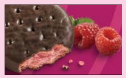
Girl Scout Cookies