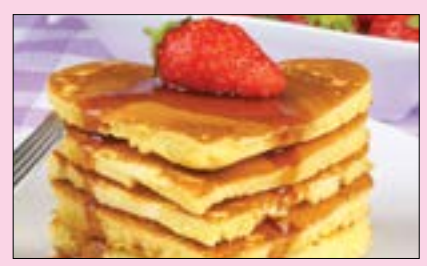
Creative ways to tell your child I LOVE YOU!