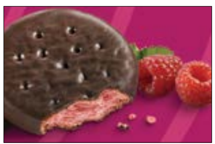
New Raspberry Rally Cookie

Every Girl Scout Cookie purchase fuels local Girl Scouts' adventures throughout the year: exploring what interests them, discovering their passions, and taking action on issues they care about. Whether they're using their STEM skills to solve a problem, changing a law to help their community, having a courageous outdoor experience, or starting an innovative nonprofit, Girl Scouts build a better future for themselves and the world. And through the Girl Scout Cookie Program, including earning the new Cookie Business badges, girls get a taste of being