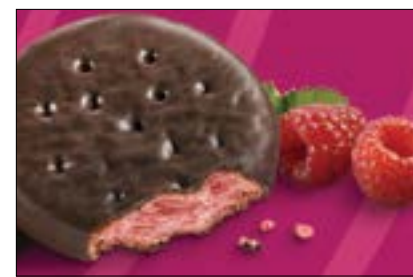
New Raspberry Rally™ Cookie

Every Girl Scout Cookie purchase fuels local Girl Scouts' adventures throughout the year: exploring what interests them, discovering their passions, and taking action on issues they care about. Whether they're using their STEM skills to solve a problem, changing a law to help their community, having a courageous outdoor experience, or starting an innovative nonprofit, Girl Scouts build a better future for themselves and the world. And through the Girl Scout Cookie Program, including earning the new Cookie Business badges, girls get a taste of being