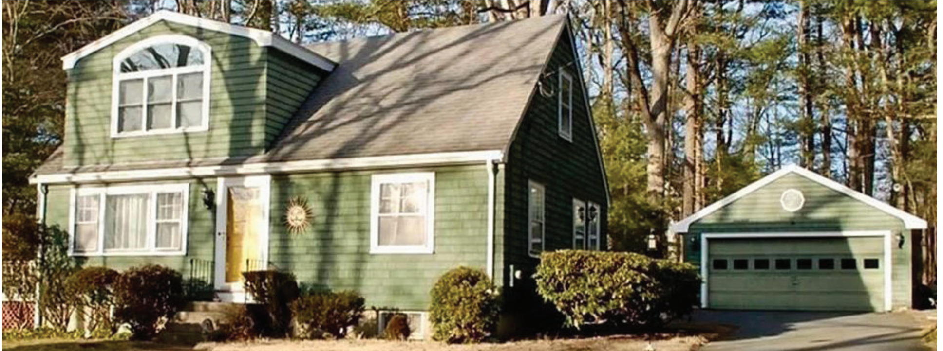
51 Bellview Heights in Ashland recently sold for $515,000. . Source: www.zillow.com / Compiled by Local Town Pages