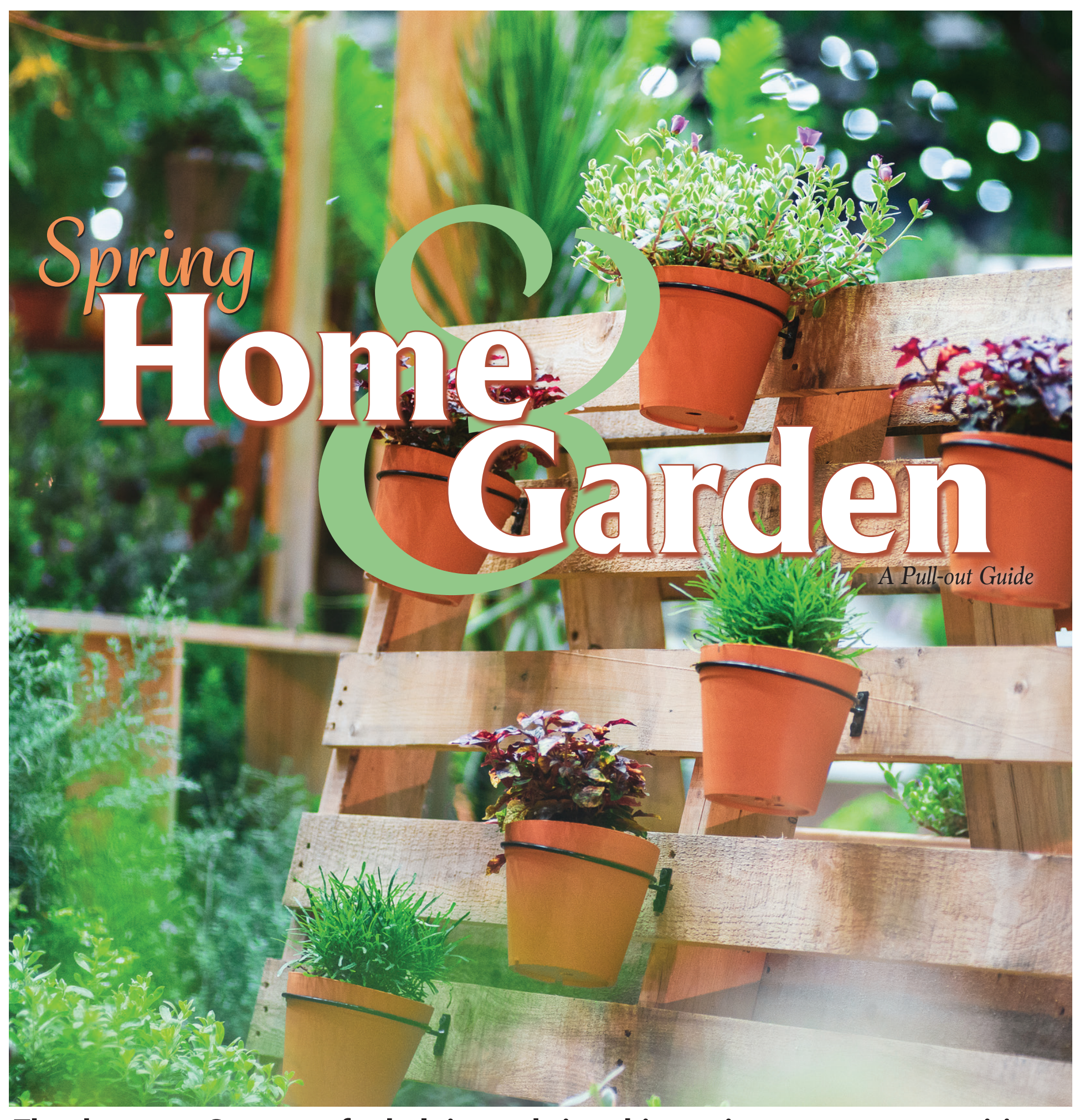
Thanks to our Sponsors for helping to bring this section to our communities ...