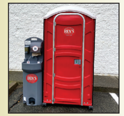
$195 month for standard restroom $175 month for cold water sink

15 & 20 Yard Dumpster Rentals Delivered & Picked Up