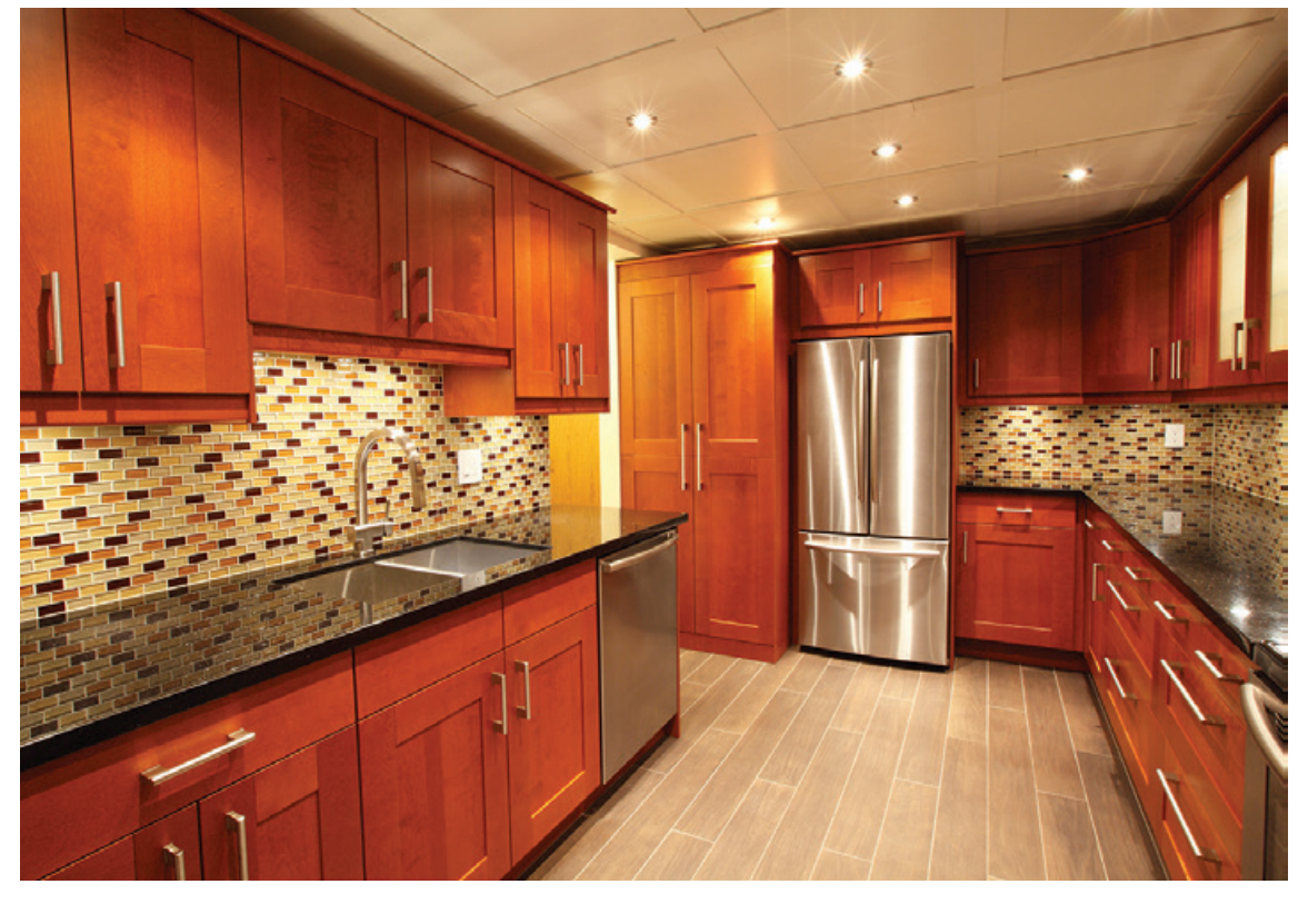
Installing uplighting beneath kitchen cabinets is an inexpensive way to give a kitchen a

• Repaint and restyle the cabinets. Cabinet space is an undeniably precious commodity in a kitchen, especially as more and more homeowners embrace their inner chef and cook more complicated meals at home. After all, the more expansive a home chef's culinary repertoire, the more space that person needs to