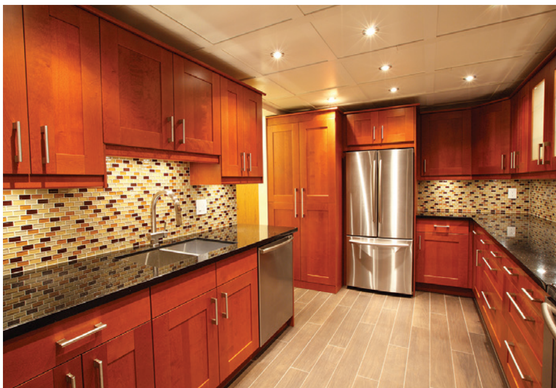
Installing uplighting beneath kitchen cabinets is an inexpensive way to give a kitchen a new look.

store all the tools of the cooking trade. A full cabinet replacement is unnecessary if the cabinets are still functional and not overcrowded, so repainting them can be a great way to give the kitchen a new look while keeping costs reasonable. During the painting project, homeowners can in-