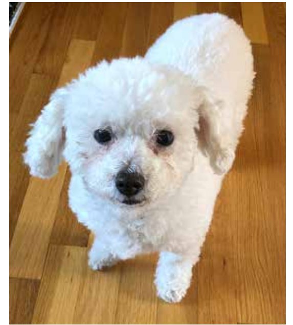
The Bichon Frise (Lulu, pictured here) was number 47 on the list of 199 dog breeds.

For the full list, visit https://bit.ly/3Z46SxQ