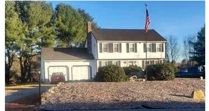
2 Colonial Drive in Mendon recently sold for $485,000. Photo credit www.zillow.com

Source: www.zillow.com / Compiled by Upton Mendon Free Press