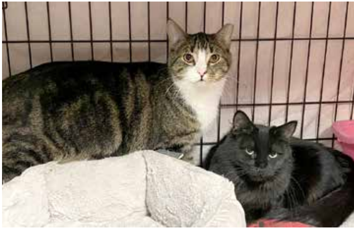
Jasada and Gumbo available at The Milford Humane Society.

This month the Milford Humane Society is featuring Jasada and Gumbo, who are two young male cats that were surrendered separately but decided to move in together; and they have been roommates ever since.