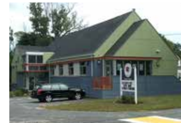
Taft Public Library.